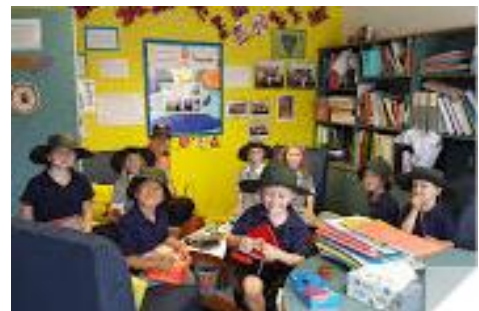
Cool kid luncheon

I also love the opportunity I get to mix with children informally. Last Friday a group of cool kids joined me in the office for lunch.