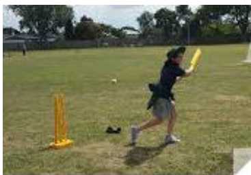
Single wicket cricket

Banks Avenue children get a huge amount of extra-curricular and leadership activities to participate in. Some of these include: Kapa haka, single wicket cricket, choir, band, media club, digi kids, jump jam and PALs (playground leaders).